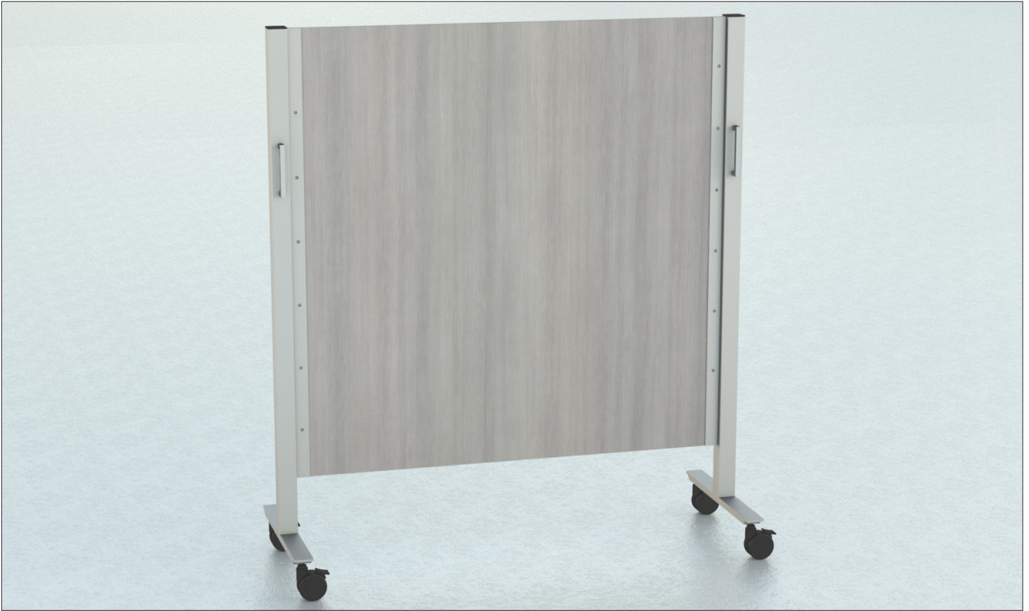
3/4" Thick Laminate Panel / 4 1/2" Thick Casters / 21" Leg Spread / 54" High