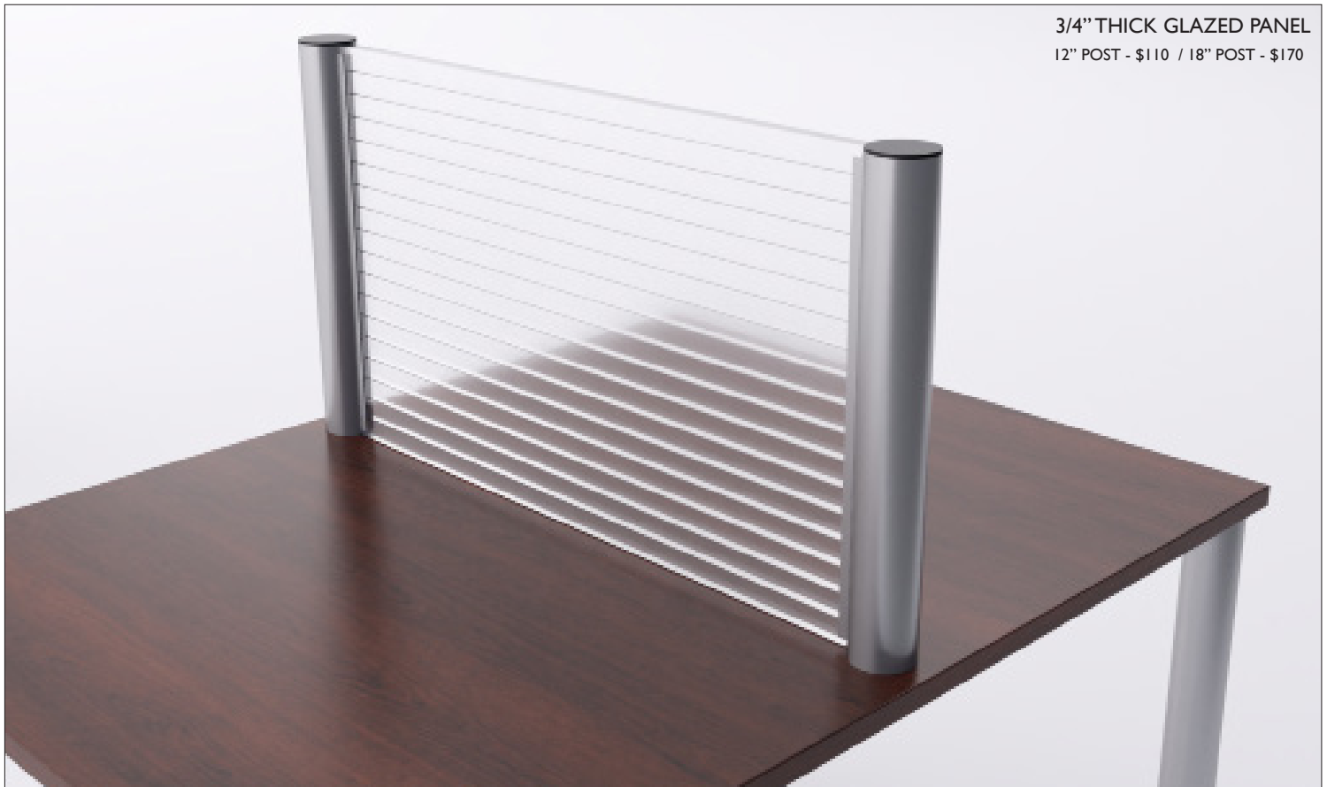
3/4" THICK GLAZED PANEL 12" POST - $110 / 18" POST - $170