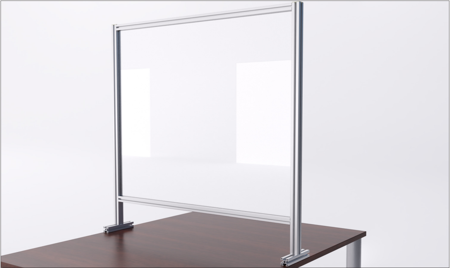
ALUMINUM FRAME POLYCARBONATE SHEILD