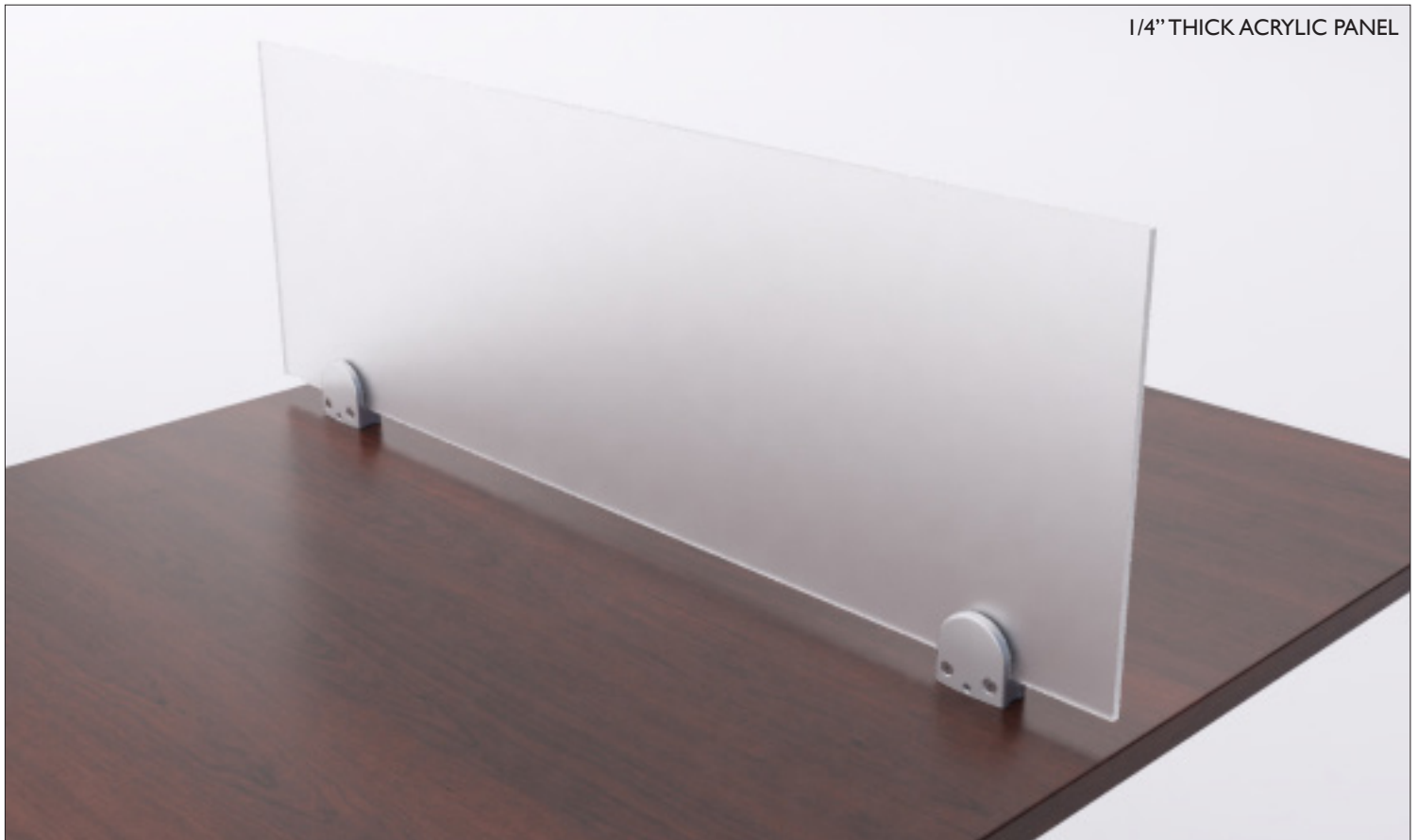
1/4" THICK ACRYLIC PANEL