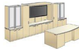
bow front desk with media/storage wall overall dimensions 180"W 114"D 90"H