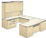
cockpit design u-unit overall dimensions 72"W 120"D 84"H