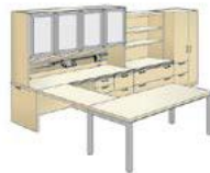
table desk u-unit with extended storage wall overall dimensions 144"W 108"D 84"H