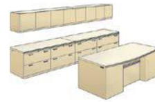
bow front desk with wall mount storage overall dimensions 144"W 114"D 70"H