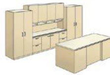
desk with credenza and wardrobes overall dimensions 144"W 108"D 84"H