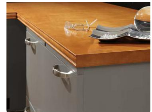
Metal Cornice Detail Media Management Wood Work Surface with Painted Chassis