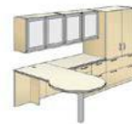
p-top desk modular station with wall mount storage overall dimensions 120"W 72"D 72"H