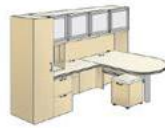
bullet desk modular station overall dimensions 102"W 72"D 72"H