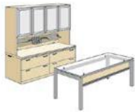
table desk with credenza overall dimensions 72"W 108"D 84"H