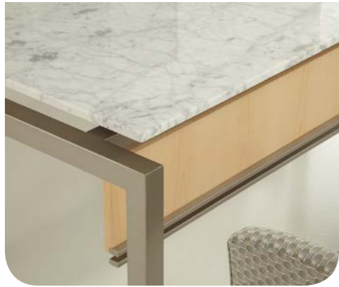
Vertical Storage Accessory Rail with Moveable Accessories Table Desk with COM Marble Top