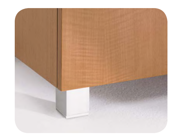
Top Aluminum elements. Spacers create floating tops. Middle Varying desk shapes and support. Concealed equipment storage. Bottom Plinth Base or Aluminum Feet