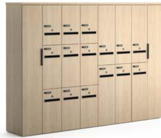
69" h lockers