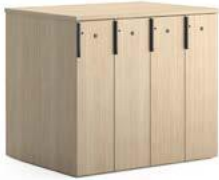
42" h lockers