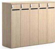
48" h lockers