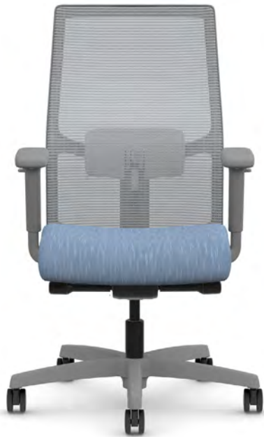
Ignition® 2.0 Task Chair

Task chairs are shown in Rush Blue Sky fabric