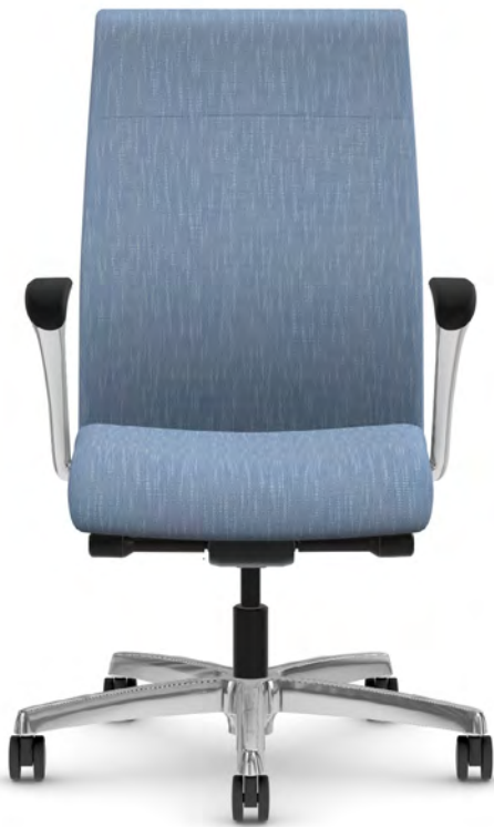
Ignition® 2.0 Upholstered Mid-back chair