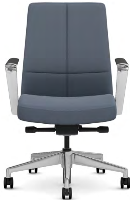
Cofi™ Managerial Mid-back chair