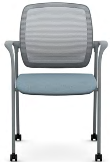
Nucleus® Guest Chair