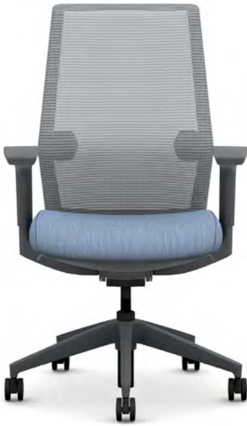
Cipher™ Task Chair