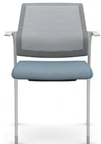
Cipher™ Guest Chair