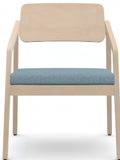
Confer™ Guest Chair