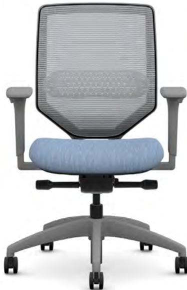
Solve® Task Chair