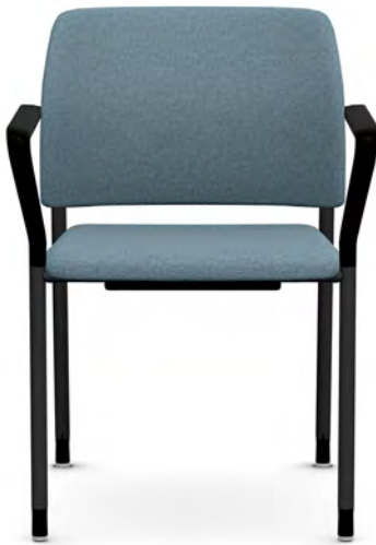
Accommodate® Guest Chair