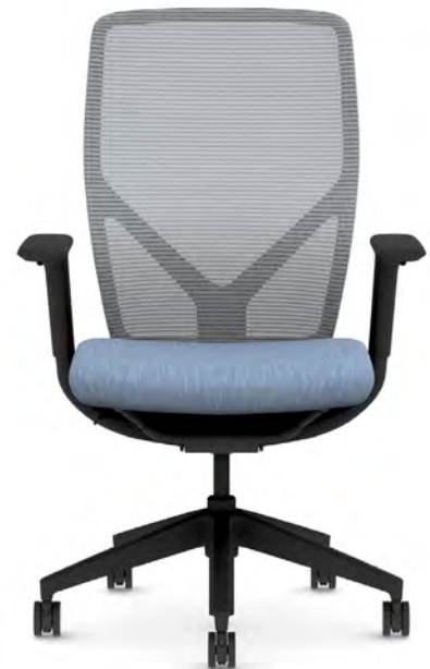
Flexion™ Touchdown/Collaborative Chair