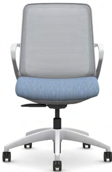
Cliq™ Touchdown/Collaborative Chair