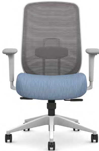
Altern™ Task Chair