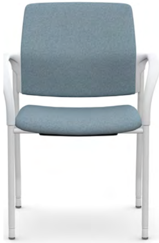
Ignition® Guest/Multi-Purpose Chair