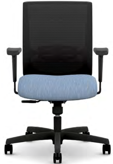
Convergence® Task Chair