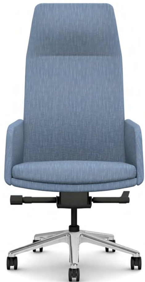
Mav™ High-back chair