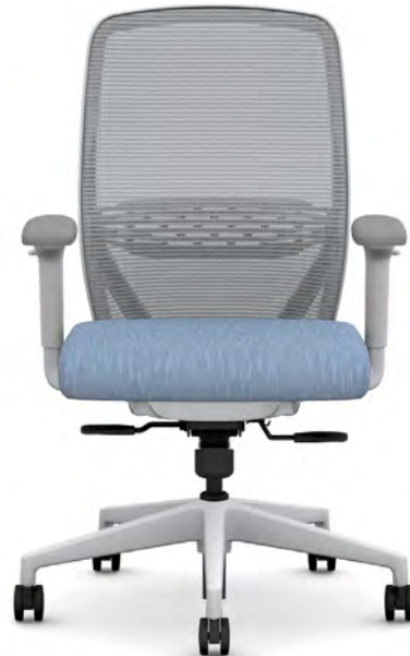
Nucleus® Task Chair