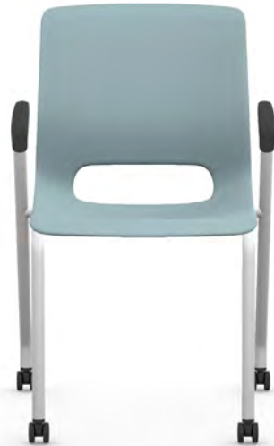
Motivate® Nesting/Stacking Chair