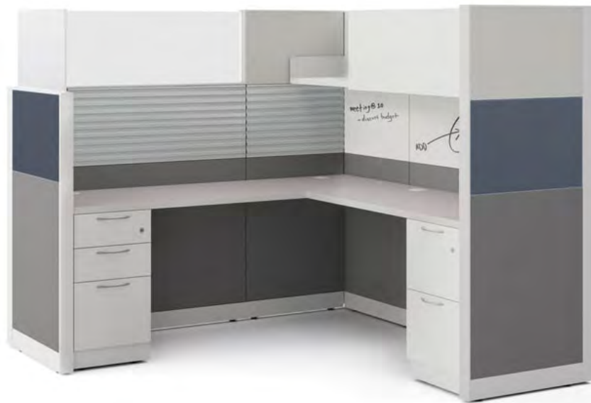
Abound ® Workstations

From focus to collaboration, HON systems combine style and function to keep productivity moving forward.