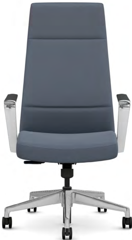
Cofi™ Executive High-back chair

Cofi shown in Whisper Vinyl Costal fabric Ignition 2.0 and Mav shown in Rush Blue Sky fabric