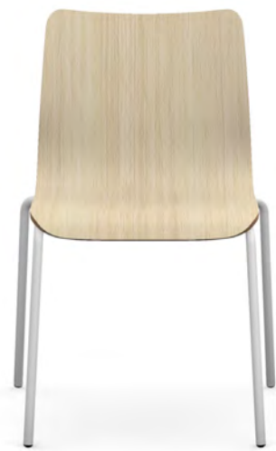
Ruck™ Multi-Purpose Chair