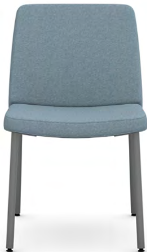
Flock® Guest Chair