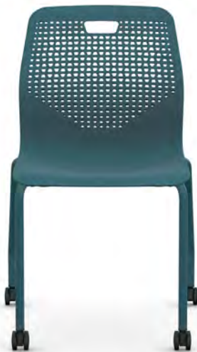
Etch™ Multi-Purpose Chair